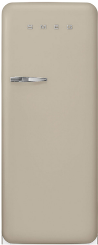
FAB28RMLM6 EAN: 8017709363239 Moonlight