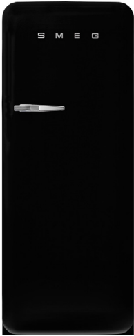
FAB28RDBLM6 EAN: 8017709352974 Matte Black