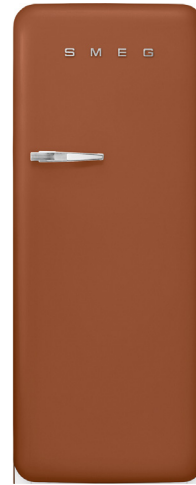
FAB28RACM6 EAN: 8017709363260 Amber Clay