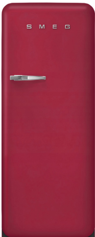
FAB28RDRB6 EAN: 8017709352950 Ruby Red