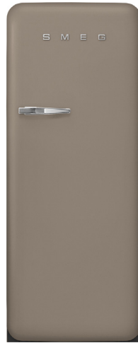
FAB28RDTP6 EAN: 8017709352905 Taupe