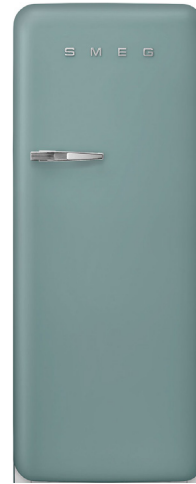
FAB28RDEG6 EAN: 8017709352899 Emerald Green