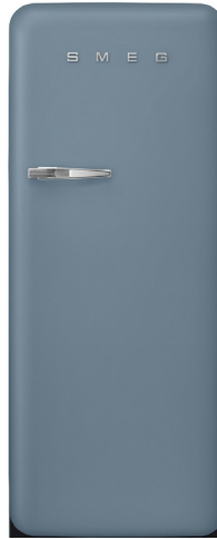
FAB28RDSB6 EAN: 8017709353025 Storm Blue