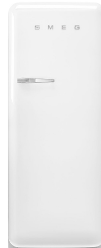
FAB28LWH6AU FAB28RWH6AU White