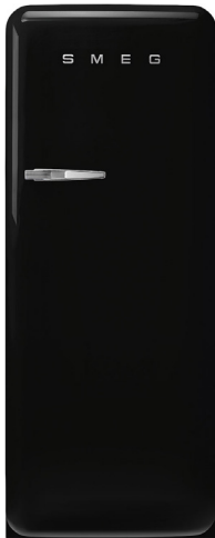
FAB28LBL6AU FAB28RBL6AU Black