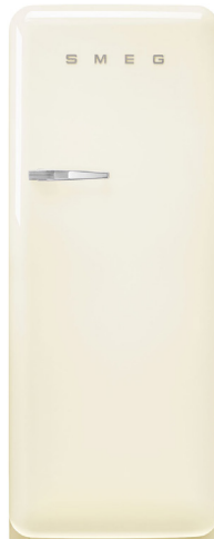
FAB28LCR6AU FAB28RCR6AU Cream