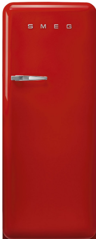
FAB28LRD6AU FAB28RRD6AU Red