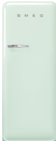
FAB28LPG6AU FAB28RPG6AU Pastel Green