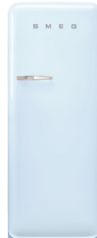
FAB28LPB6AU FAB28RPB6AU Pastel Blue