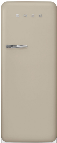
FAB28RDPP5 EAN: 8017709353032 Moonlight