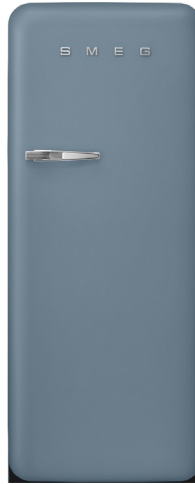
FAB28RDLB5 EAN: 8017709353025 Storm Blue