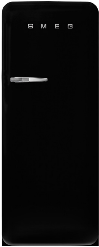
FAB28RDBLM5 EAN: 8017709352974 Matte Black