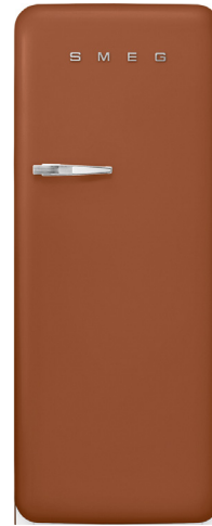
FAB28RDRU5 EAN: 8017709352943 Rust