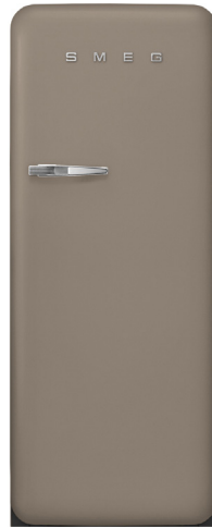
FAB28RDTP5 EAN: 8017709352905 Taupe