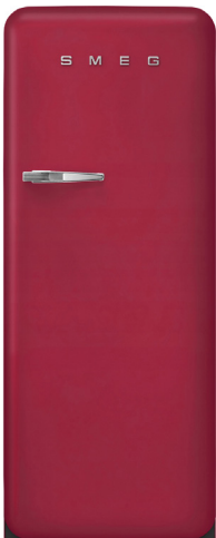
FAB28RDRB5 EAN: 8017709352950 Ruby Red