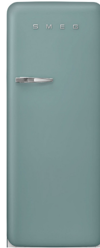
FAB28RDEG5 EAN: 8017709352899 Emerald Green