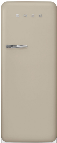
FAB28RDPP5 EAN: 8017709330606 Perfectly Pale