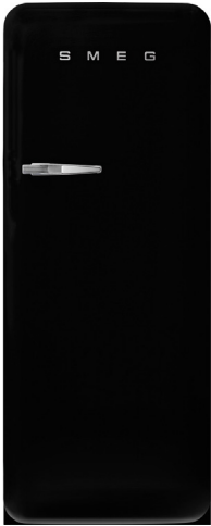
FAB28RDBLM5 EAN: 8017709330637 Matte Black