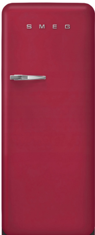
FAB28RDRB5 EAN: 8017709299217 Ruby Red