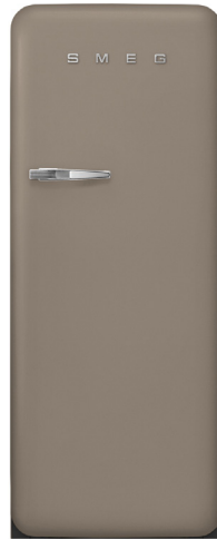
FAB28RDTP5 EAN: 8017709299224 Taupe