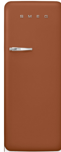
FAB28RDRU5 EAN: 8017709330613 Rust