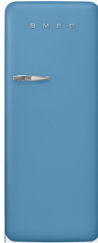
FAB28RDLB5 EAN: 8017709330620 Light Blue