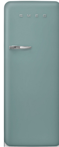
FAB28RDEG5 EAN: 8017709299149 Emerald Green